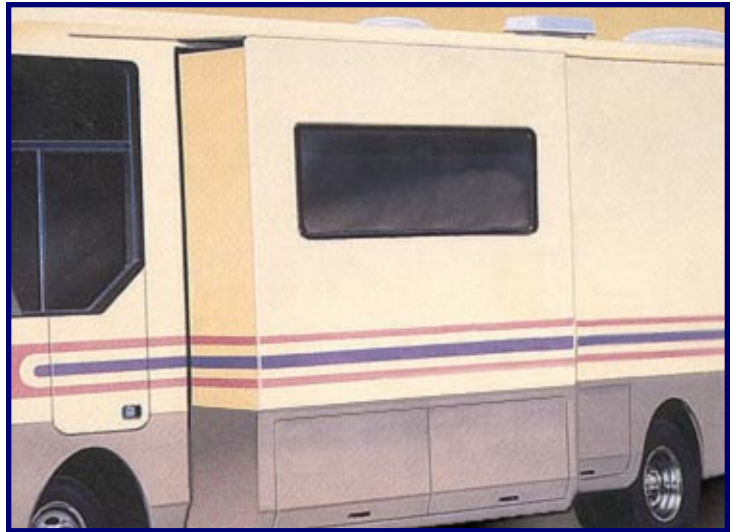
Exterior of room and coach.