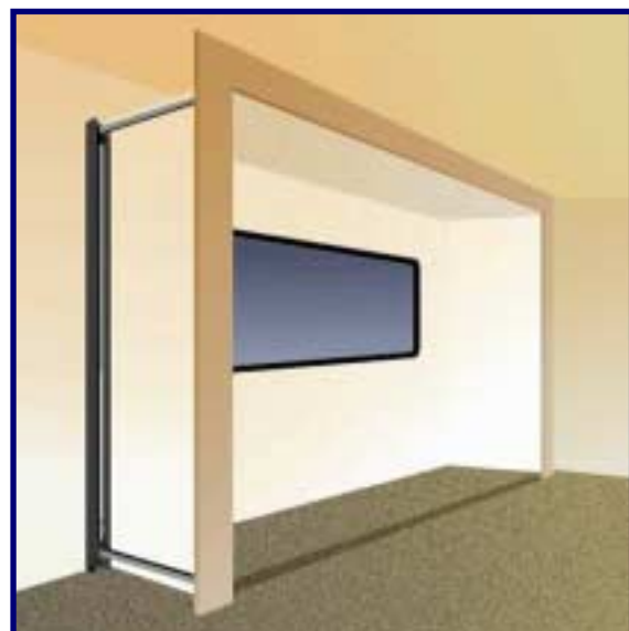
Interior view of room.