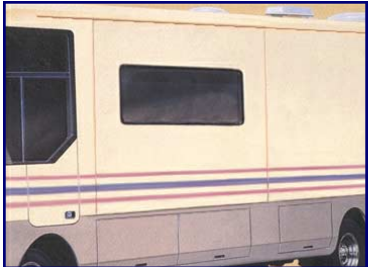
Exterior of room and coach.