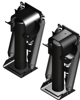
AP0229 Jack Kit

Two Kick-Down (Power-Extend/Spring-Retract) Jacks with a lifting capacity of 6,000 lbs. per jack Standard Profile