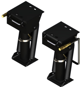
AP0228 Jack Kit

Two Kick-Down (Power-Extend/Spring-Retract) Jacks with a lifting capacity of 6,000 lbs. per jack Standard Profile