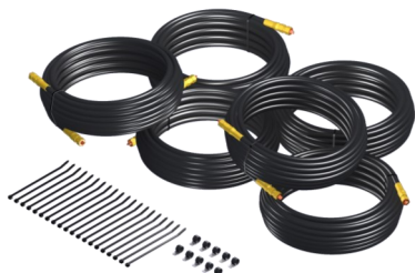
AP0240 Hose Kit

225 Series, Joystick-Controlled Hydraulic Leveling System with BI-AXIS ® Control and Integrated Indicator Light Panel & Leveleze ® Light Package