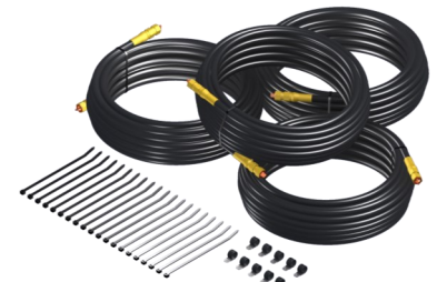
AP43072 & AP43085