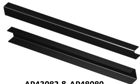
AP43082 & AP48080 Crosstie Outer