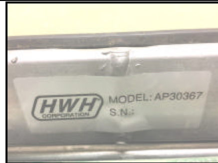
COMPONENT LABEL INSIDE BOX