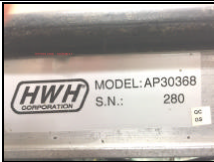
ASSEMBLY LABEL OUTSIDE BOX

ALL ASSEMBLIES, SINGLE OR STACKED, WILL HAVE ONE “ASSEMBLY” LABEL LOCATED ON THE OUTSIDE, AND EACH RING, WILL HAVE A “COMPONENT” LABEL ON THE INSIDE, AS SHOWN BELOW.